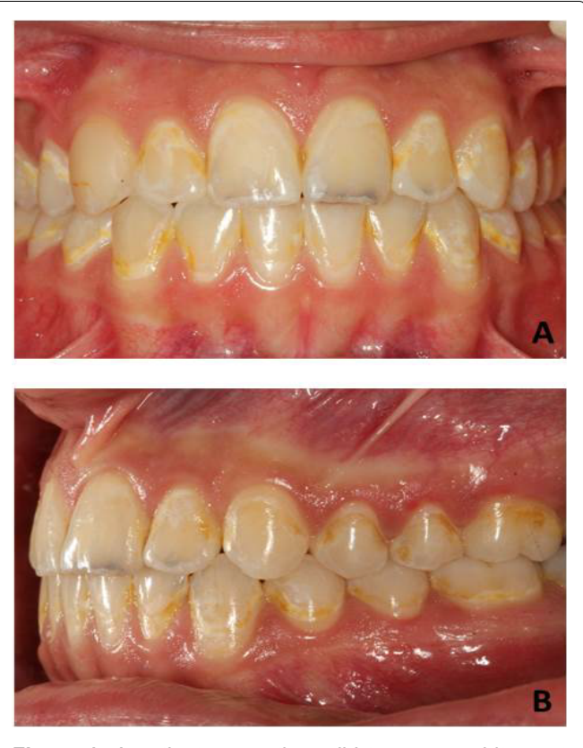
Figure 1: A patient presenting mild to severe white spot lesions in number of teeth after orthodontic treatment. A) Intraoral frontal view; B) Intraoral lateral view.

counts [4]. It was reported that following application of orthodontic appliances, a rapid change in bacterial composition of plaque was observed, and the amount of acidogenic bacteria such as Streptococcus mutans and Lactobacillus significantly increased. These bacteria reduce pH level of plaque in presence of fermentable carbohydrates. Decalcification occurs when the pH level of oral environment falls below the threshold level of remineralization [3].