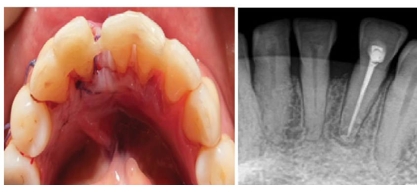
Figure 5: Post-operative photograph and radiograph showing resolution of the lesion.

material (Bio-Oss, Geistlich ) and membrane (Bio-gide, Geistlich ) (Figure 5).