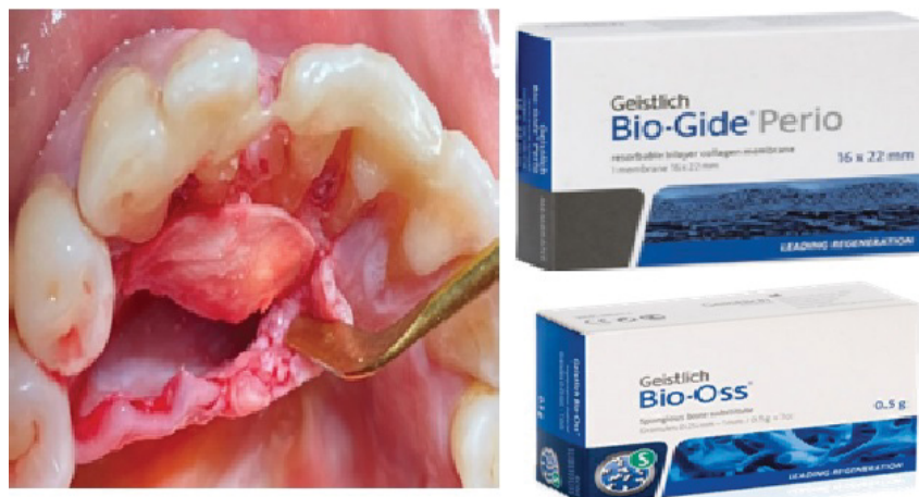
Figure 4: Intraoral photograph showing cyst enucleated and cavity filled with bone augmentation and membrane.