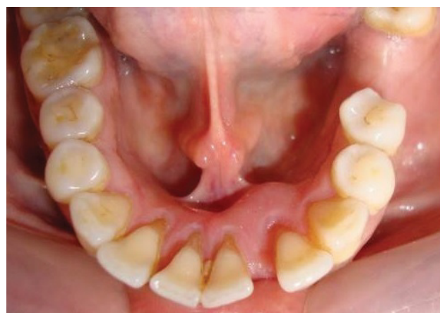
Figure 1: Clinical photograph showing the location of the cystic lesion.

A 65-year-old female patient reported to the Ministry of Health primary care dental clinic in Bahrain, with a chief complaint of an asymptomatic swelling in the lingual side of the mandible, in the region between the left mandibular lateral incisor (#32) and canine (#33), for the past 2 months. A widening diastema between these teeth was also reported. The patient's past dental history revealed multiple nonsurgical periodontal therapy in the same region, for the presenting complaint, with no