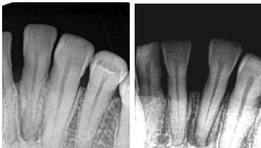
Figure 2: Periapical radiograph showing circumscribed radiolucent area confined to #32.