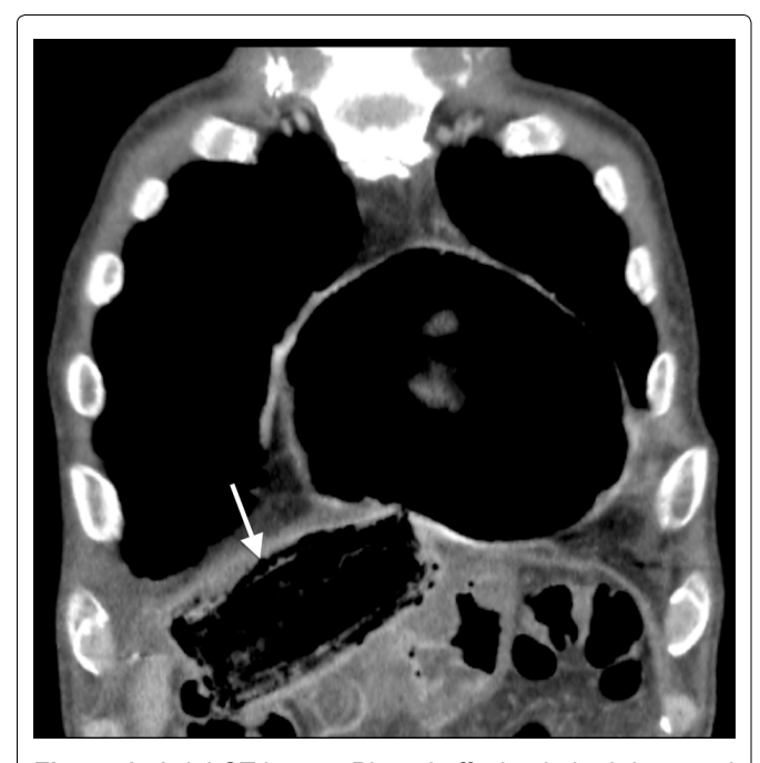
Figure 1: Axial CT image. Pleural effusion in both lung and hydropneumopericardium were confirmed.