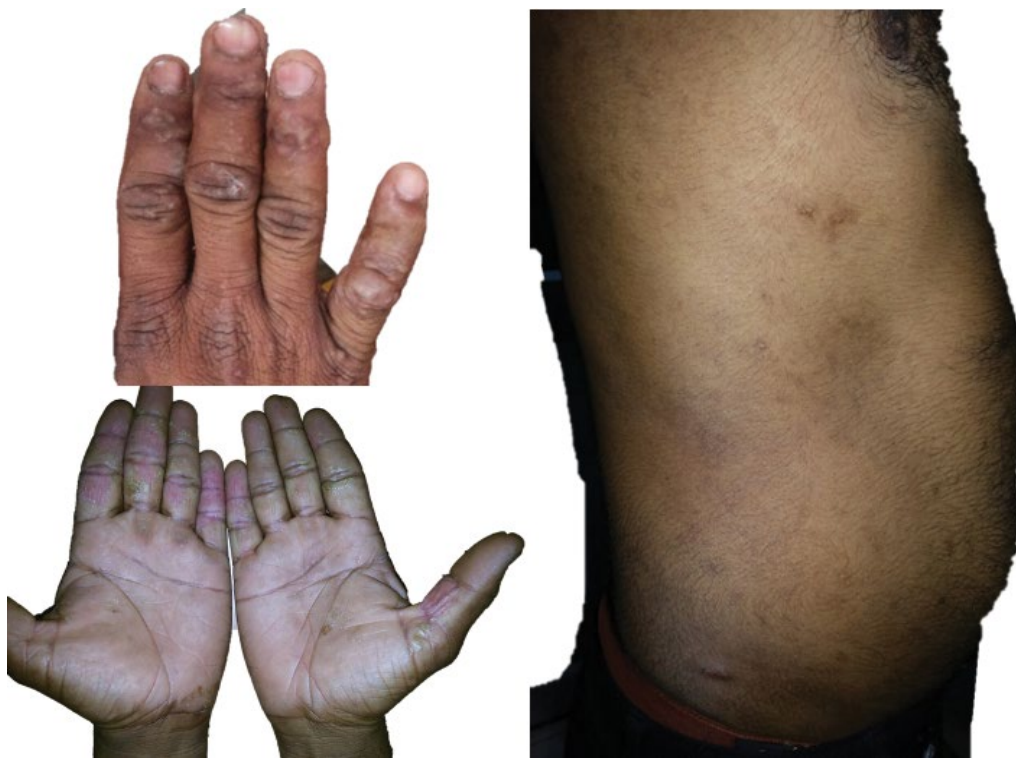
Figure 1: Numerous variably sized flesh hyperkeratotic papules on the dorsal aspect of hand, and trunk along with sparing of palm.