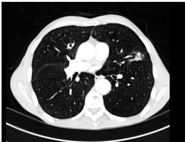
Figure 1: Chest computed tomography showing an irregular speculated mass in the left-upper lobe.