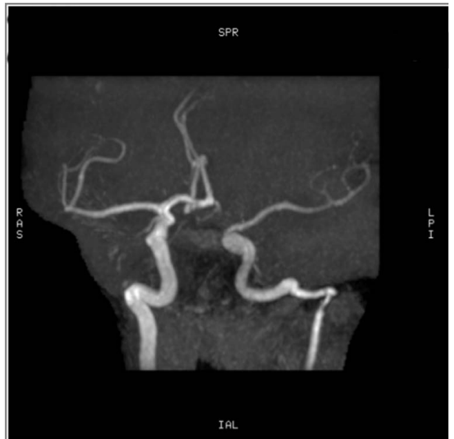
Figure 2A: Magnetic resonance angiography showing reduced diameter and lateralization of the left internal carotid artery (ICA). The right ICA is normal. Hypoplasia of the A1 segment of the left anterior cerebral artery (ACA) is also noted.