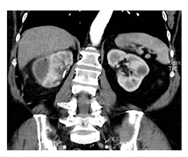
Figure 1: Axial-view contrast-enhanced CT in the corticomedullary (A) and nephrographic (B) phases and coronal-view CT in the corticomedullary phase (C) showing a right renal subcapsular collection with enhancing walls in keeping with a subcapsular haematoma (white arrowhead in A, B and C). A fistulous tract between the haematoma and the duodenum with gaseous content can be seen (arrow in A). Just inferiorly, gaseous content can also be seen inside the haematoma (arrow in B).

der fluoroscopic guidance and the bladder was emptied. After postoperative observation and evaluation, the patient was discharged home.