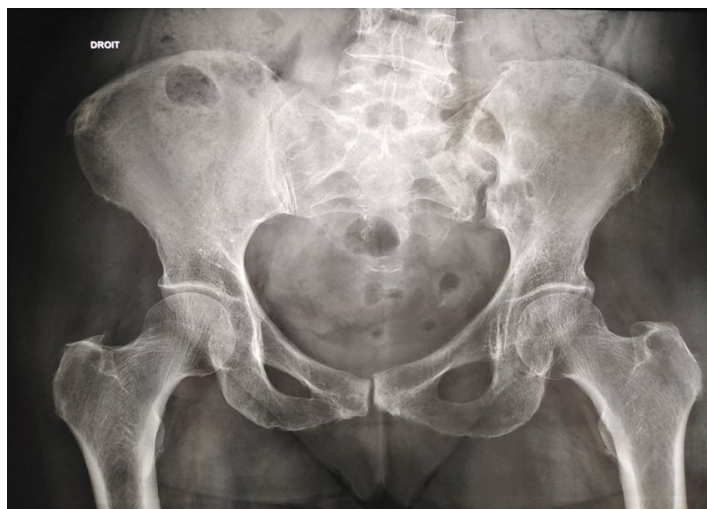
Figure 1: Plain radiograph of the pelvis showed widening of the left sacroiliac joint space with erosions of the subchondral bone.