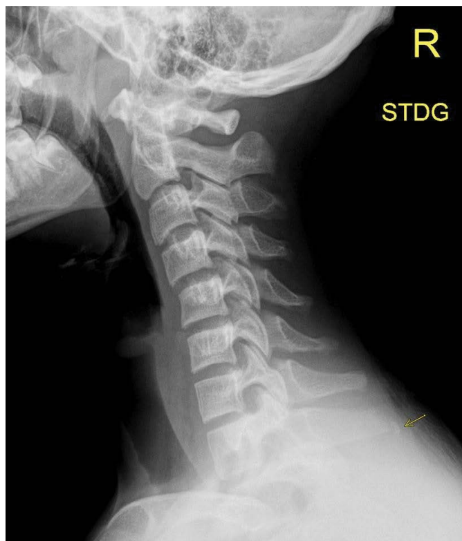
Figure 1: Lateral radiographs of the cervical spine demonstrating a small, well-corticated osseous fragment along the posteroinferior aspect of the T1 spinous process, consistent with a minimally displaced spinous process fracture.