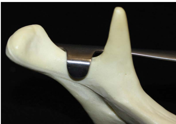
Figure 2: Lingual view showing the protection that the Bauer retractor provides.

of IVSRO, this work aims to simplify the traditional technique: by wearing the outer cortex and weakening the internal cortex with a conical drill stem and minimum lingual tissue detachment only to position the Bauer retractor support (Figure 2), the potential damage to the adjacent neurovascular structures is minimized. In this way, the safety of the procedure is maintained and, consequently, surgery time is reduced. Concerns over damaging structures such as the maxillary artery were reported [6], which analyzed the anatomical variations and possible complications caused by IVSRO. They also highlighted the importance of performing procedures in the mandibular notch region with caution and using a spacer in the region to protect the area. In addition, they recommended tomographic images to localize the mandibular foramen in the preoperative period in order to avoid injury to the inferior alveolar nerve. A modification of the classical osteotomy technique that is very similar to IVSRO was proposed