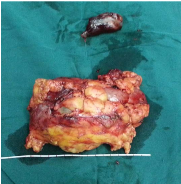
Figure 2: Postoperative specimen showed left kidney cancer and cancer thrombus

patients; for the presence of the vena cava wall invasion, the complete resection of the infiltrated inferior vena cava wall will leave a survival rate with no significant difference compared with that in patients without vena cava invasion [6]. The cancer embolus, therefore, is considered not an independent poor prognostic factor for patients with kidney cancer; for advanced patients, the cytoreductive surgery is also beneficial for the further treatment and rehabilitation. The selection of surgical methods depends largely on the type of the vena cava cancer embolus and the absence or presence of vena cava wall infringement. For the type I, II and III cavity vein cancer embolus, the patients without infiltrated caval vein can undergo procedures without cardiopulmonary bypass; for the type IV vena cava cancer embolus and infiltrated caval vein, the patients are required to undergo procedures with cardiopulmonary bypass. And, many surgeries also required more than one surgeon from different departments. In procedure, the full exposure of operative field is necessary to prevent hemorrhage and embolus shedding to cause pulmonary embolism.