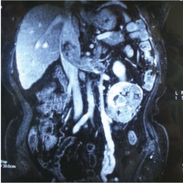
Figure 1: 3d CT showed left kidney cancer merge renal vein and the inferior vena cava with tumor thrombus