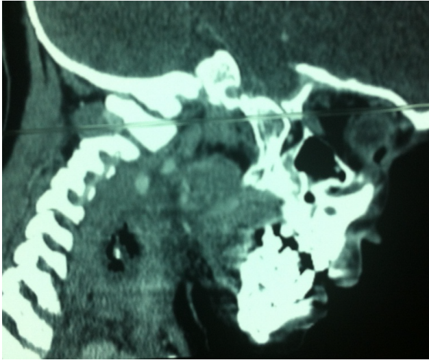
Figure 2: CT sagittal image of neck showing the metallic foreign body.