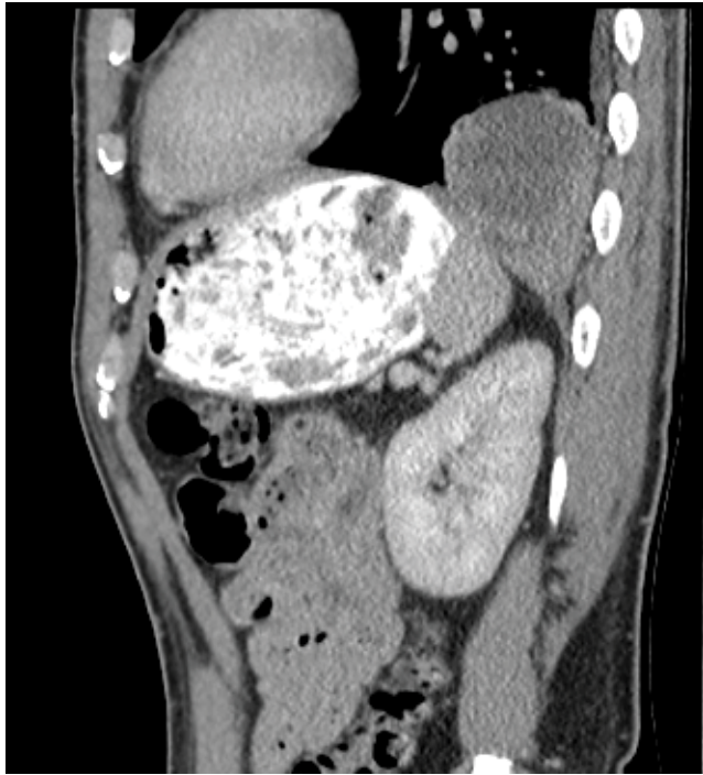
Figure 2: Sagittal CT of lesion

Further imaging with an ultrasound did not give a definitive diagnosis either. The scan revealed internal separations and variable wall thickness giving a differential of an empyema or a cystic mass.