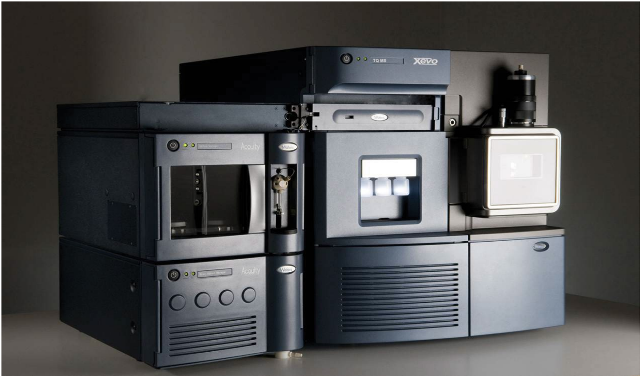
Figure 1: UPLC Acquity Ultra Performance LC XevoTQ MS. Equipment used for measuring antibiotic concentrations by mass spectrometry.