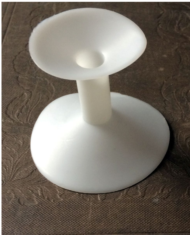
Figure 2: The Nash rectal funnel.

(Figure 2) was then inserted under local anaesthetic with impressive initial drainage of the collection, with 50 ml of pus was drained instantly. The rectal stump remaining was only 4 cm and the barrel of the funnel is 4 cm. It is made of