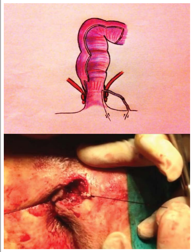
Figure 2: Curettage of the fistula tract using traction applied to the curette by the two sutures.

The alternative approach we consider is to use a set of graduated, cylindrical curettes (Figure 1) which are small enough to be passed along the entire fistula tract. Each such curette has a hole at the extremities through which sutures are tied; these are then passed through the fistulous orifice, which allows us to apply traction at both ends of the curette, thus drawing it from one end to the other of the tract as many times as neces-