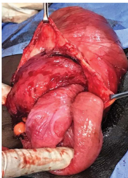
Figure 2: Opening of the hernia sac revealing the small bowel with the tumour.

deliver the sac and scrotal contents into the wound (Figure 1). As the testicle was normal in appearance, the sac was opened in order to inspect its contents. A bowel segment was firmly attached to a fleshy lesion measuring about 7 cm in diameter adjoining the testicle (Figure 2). The testicular appendage was divided and the small bowel adherent to the sac via fibrinoid adhesions was resected with end-to-end bowel anastomosis in two layers using 2/0 Vicryl and 4/0 PDS respectively. The testis along with the hernia sac was resected and the hernia defect closed using 2/0 Vicryl. A modified Shouldice repair was performed using 2/0 Nylon. He was well enough to self-discharge two days later and was well when seen two weeks postoperatively.