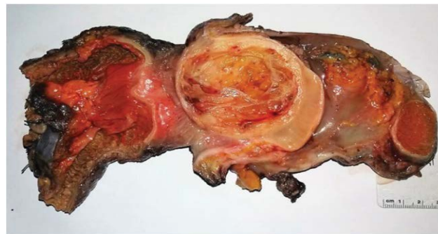
Figure 3: Gross photograph of paratesticular lesion with a central cystic/myxoid degeneration.

The resected specimen consisted of a fibrofatty