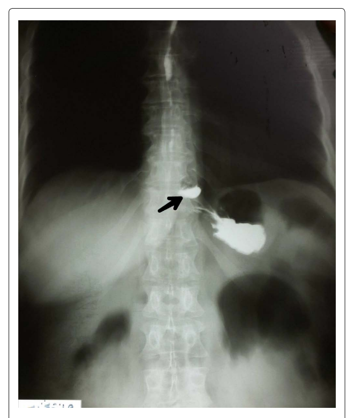
Figure 1: Contrast radiogram showed a diverticulum in the left side (arrow).