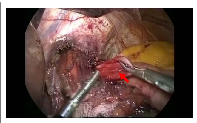
Figure 2: This image shows the Dor anterior fundoplication. The red arrow indicates to the diverticulum.

On the first postoperative day, a liquid diet was prescribed and the patient was discharged from hospital next day with some recommendations and soft diet for three weeks. On follow up for one year, she was in a good health state and gained weight normally. There was no complain of dysphagia or other symptoms.