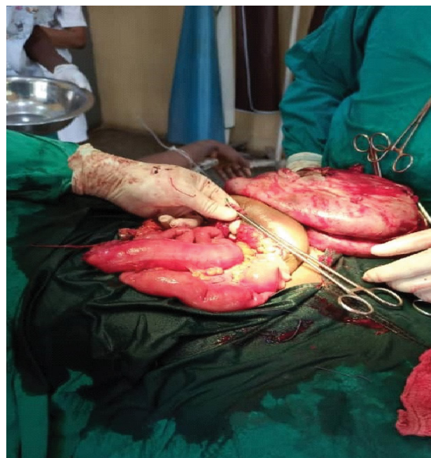
Figure 3: excised specimen containing dark green fluid.

The encysted mass was partially drained to facilitate dissection, close inspection revealed involvement of the mesentery of the transverse colon. No adhesions were found between the cyst wall and the other intraabdominal structures. The cyst was carefully dissected from the mesentery of the transverse colon sparing the blood supply. Complete enucleation of the cyst was accom-