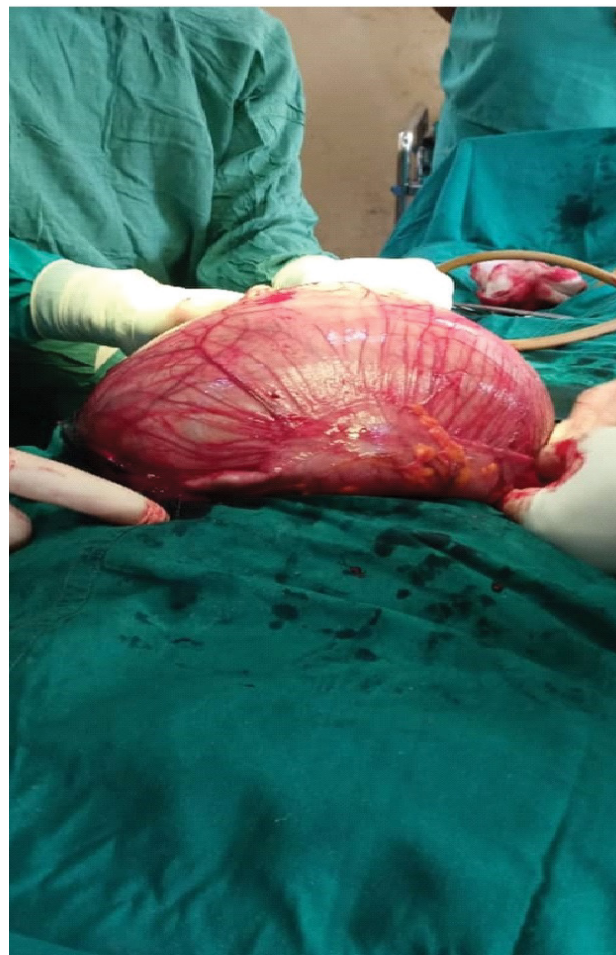
Figure 2: Encysted mass arising from the mesentery of the transverse colon.

or anorexia. Physical examination revealed the patient to be in fair general condition with no wasting. Abdominal examination revealed uniform distension with no clear delineation of any abdominal masses. Other systemic examinations were unremarkable. The initial blood workup included complete blood count, serum electrolyte and renal function all which were within normal range. The patient was hepatitis-B surface antigen negative and sero-negative for human immunodeficiency virus. Imaging investigation included an abdominopelvic ultrasound scan, which revealed a cystic mass occupying much of the abdominal cavity, with no clear site of origin. It measured approximately 30 cm × 20 cm and for a better localization and delineation of the cystic mass, computed tomogram was requested but could not be done due to financial constraint. On the basis of the presentation and imaging findings on ultrasonography, the patient was prepared for exploratory laparotomy. At surgery, the cyst was observed to occupy almost the whole abdominal cavity [5] (Figure 1 and Figure 2).