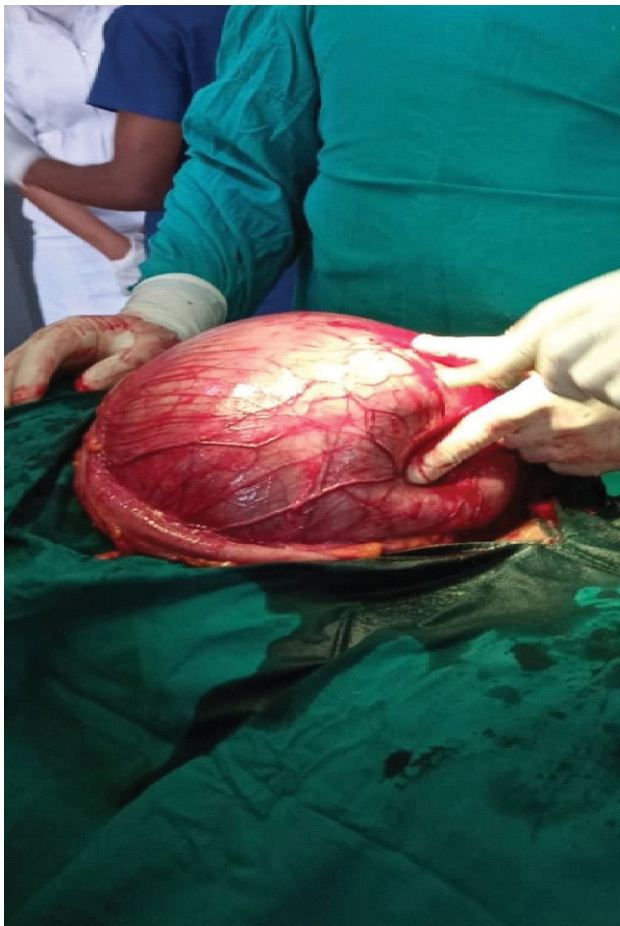
Figure 1: Intraoperative encysted mass.