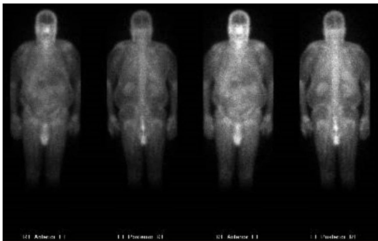
Figure 2: Gallium scan showing renal uptake of radiotracer.