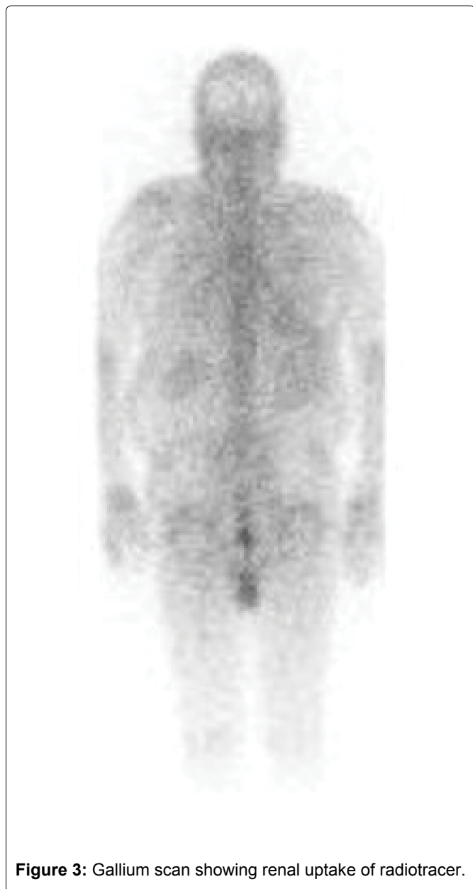
Figure 3: Gallium scan showing renal uptake of radiotracer.

Informed consent was obtained from the patient included in this report, including permission for publication of data and clinical images.