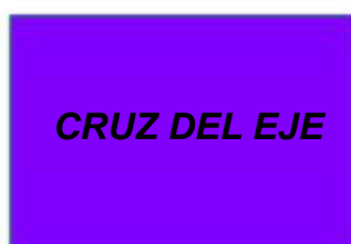
Figure 3: Chromatic risk for Cruz del Eje.

color (Figure 1). In our case, we represent in red the vulnerability of FNS, green for social vulnerability and blue the climatic one. Thus, the vulnerability intensity of these components can be represented by the intensity of the corresponding color, being 0 (low vulnerability), 125 (medium vulnerability) and 255 (high vulnerability).