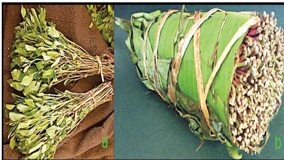
Figure 2: Fresh khat ( Catha edulis ) leaves on sale in market (a) khat ( Catha edulis ) leaves and shoots wrapped in banana leaves (b).

Khat ( Catha edulis ) leaves are a legal stimulant widely used by many peoples in Ethiopia [29,30]. The fresh leaves consumed without washing or any treatment and hence the possibility of causing disease to human is high. The khat ( Catha edulis ) leaves can easily get contaminated with pathogenic microorganisms during harvesting through human handling, harvesting equipment, transport container, wild & domestic animals. There is opacity of data, on this regard and future studies should be conduct to know the microbial dynamics of khat ( Catha edulis ) leaves. Studies indicated different types of pathogenic virus, bacteria, spores of fungi and worms were isolated from surface of leaves [31-35]. Infection of a healthy person is by eating raw leaf and viral infection might be through touching own nose and eye by own infected hands. In Ethiopia, khat ( Catha edulis ) is chewed in groups and these gathering further enhance person to person transmission. Hence, the novel coronavirus is contagious and can easily transmit from infected to healthy peoples through khat directly via infected khat ( Catha edulis ) leave and indirectly by favouring people gathering. To this end, strong controlling measures should be taken in order to avoid peoples gathering for chewing khat and awareness creation of the mass extremely important to avoid infection