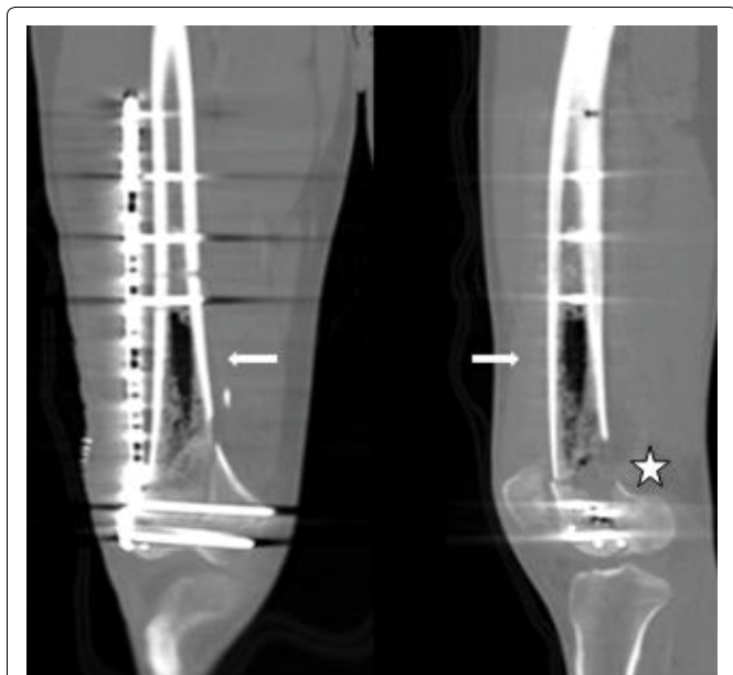
Figure 2: Last CT in coronal (left image) and sagittal (right image) planes with bone windowing, at the same level than Figure 1. A wide presence of air into the medullary canal of the right femoral diaphysis can be depicted (arrows). A posterior cortical defect is shown (next to the star).

the isolated germ, as the enterococcus is not a gas producer), we decided to perform watchful waiting under active clinical-analytical surveillance, removing all antibiotic therapy after 12 days.