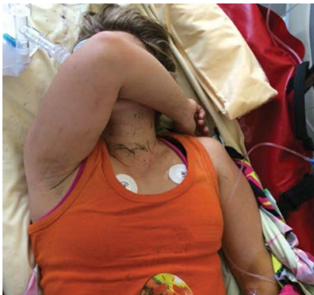
Figure 1: Clinical presentation of the patient in the emergency room with an abducted arm and impossibility of mobilization of the right shoulder.