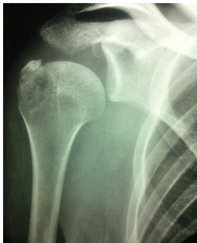
Figure 3: Antero-posterior X-ray view of the right shoulder after closed reduction of the dislocation with a reduction of the greater tuberosity.

At 10 months postoperatively, the patient didn't report neither pain nor neurological palsy. She regained a nearly full active range of motion in the shoulder and had no apprehension or instability toward elevation