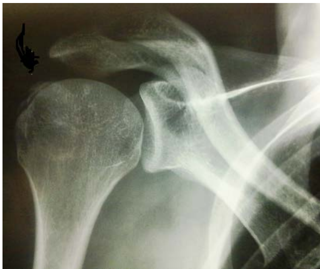
Figure 5: Antero-posterior X-ray view of the right shoulder at final outcome.