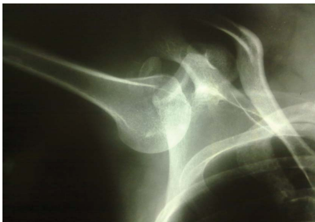
Figure 2: Antero-posterior X-ray view of the right shoulder: Inferior dislocation associated with a fracture of the greater tuberosity.

up, in a rotated position, with the dislocated humeral head below the glenoid fossa associated with greater tuberosity fracture (Figure 2). Manipulative reduction by traction-counter-traction was performed immediately under general anesthesia. Counter-traction was applied with a rolled bed sheet placed superior to the shoulder. The radiographic views, checked immediately after close reduction, revealed anatomic reduction of the humeral head into the glenoid fossa and reduction of the greater tuberosity fracture (Figure 3).