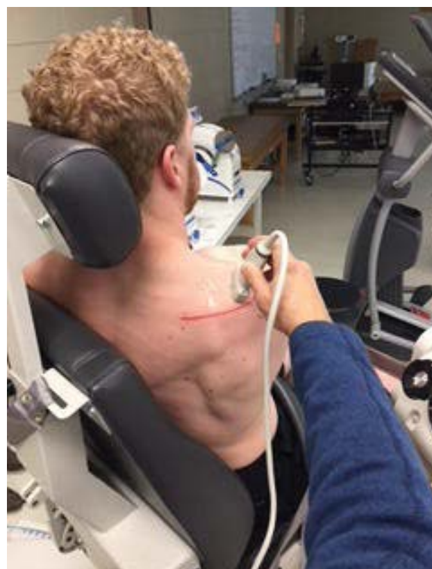
Figure 2: Position of ultrasound transducer of supraspinatus fossa.

In the present study, the use of MSK to measure contraction using the DHA test of the SM was performed by one examiner trained in the use of diagnostic ultrasound for musculoskeletal conditions and with 10 years of experience. All CSA reading and measurements were