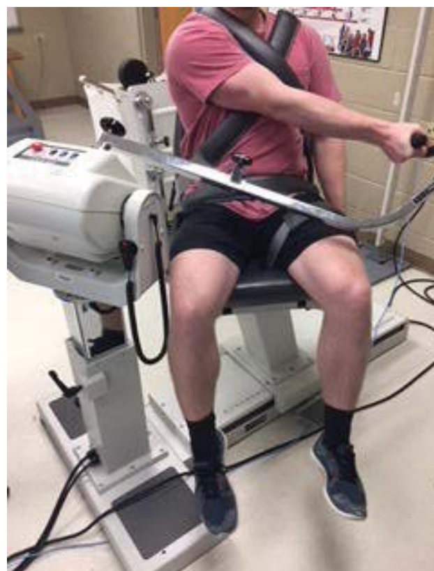
Figure 1: Test position of subjects on isokinetic dynamometer.

The alternative means of evaluating contraction of a muscle, such as the SM, through measurement of the changes of the muscles cross-sectional area (CSA) with diagnostic musculoskeletal ultrasound (MSK) has been analyzed [17,19]. Two groups of researchers, Grazioli and colleagues [23] and Juul-Kristensen, et al. [24] used CSA of muscle through MRI analysis and determined that CSA measurement changes could be used in de-