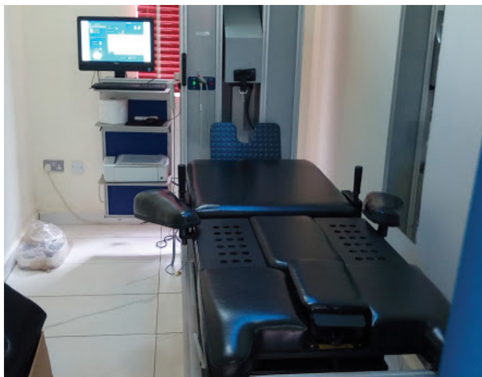
Figure 1: IDDT therapy machine by Accu-Spina (Steadfast Corporation Limited, Essex, United Kingdom).

Following the limitations of hands-on treatment techniques and the pitfalls of traditional traction, Intervertebral Differential Dynamics (IDD) was developed in the late 1990's for isolated 5 to 7 millimetres of vertebral distraction surrounding an injured cervical or lumbar disc