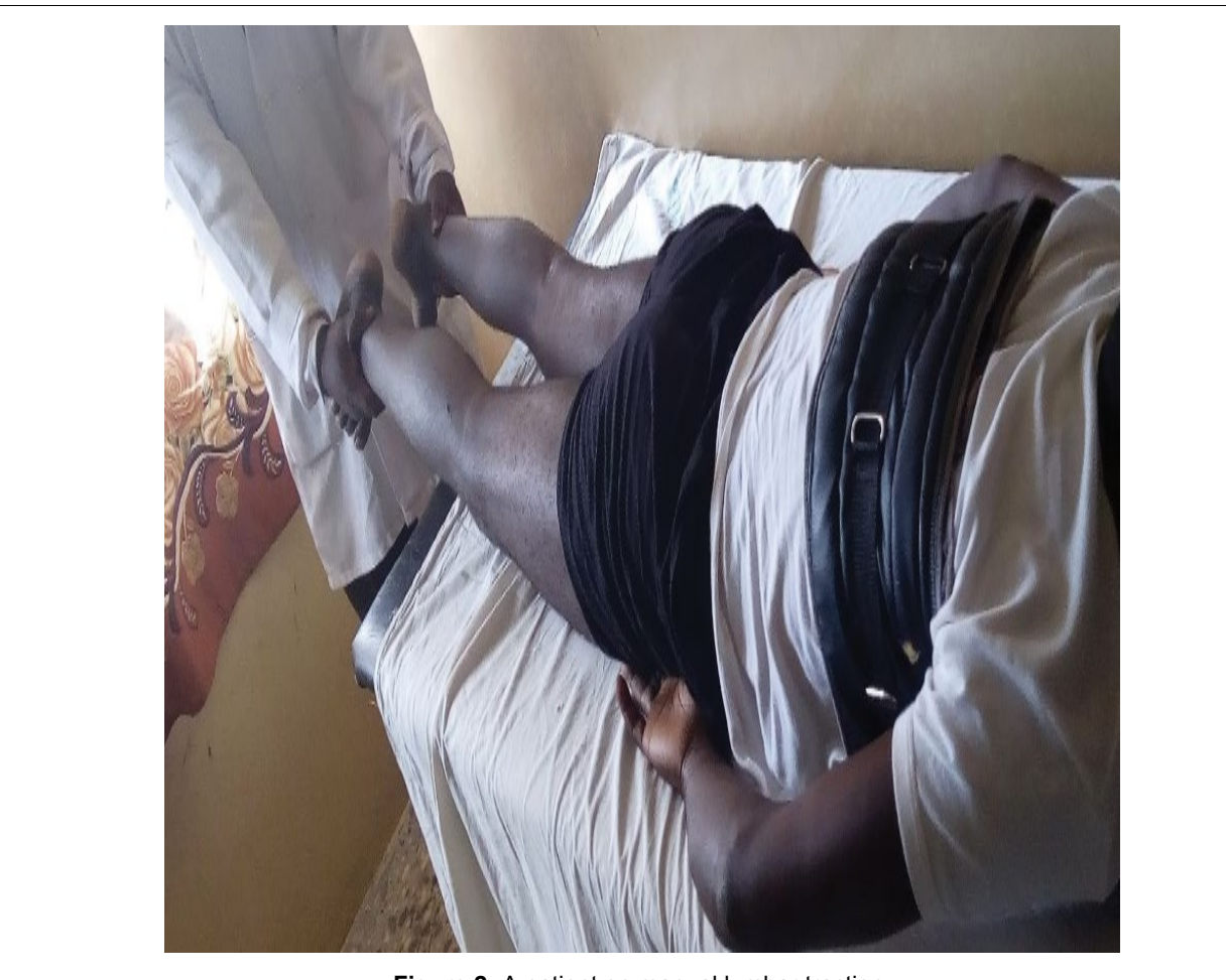
Figure 2: A patient on manual lumbar traction.