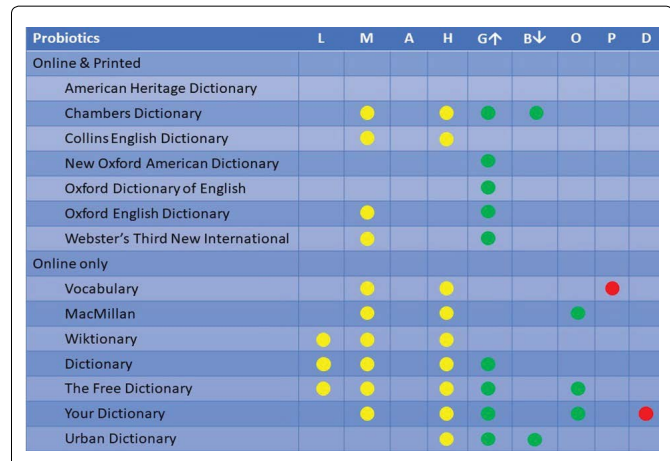
Figure 3: Analysis of the description of "probiotics" in online versions of printed dictionaries and in online only dictionaries. Yellow dots indicate whether the following components of the definition of probiotics are included in the description: Live (L) microorganisms (M), when administered in an adequate amount (A) have a health benefit on the host (H). Green dots used for functionality of probiotics: stimulation of beneficial bacteria (good; G \uparrow ), inhibition of pathogens (bad; B \downarrow ) or other health effect (O). Red dots indicate that the description of probiotics is related to plants (P) or doubts are expressed in the description ("presumed", "supposed") (D).

of the health benefit was indicated, this mostly reflected the digestive system and specifically the stimulatory effect on (other) beneficial bacteria. The stimulatory effect of probiotics on the immune system was not mentioned in dictionaries. Inhibition of potential pathogens was only indicated twice. In this context, it should be mentioned that the European Food Safety Authority, in their evaluation of health claim applications for probiotics, do not consider the stimulation of beneficial bacteria to be a health effect [3]. However, EFSA indirectly allowed almost all probiotics by QPS list. Inhibition of potential pathogens is considered to be a (potential) health benefit, if supported by additional evidence [3].