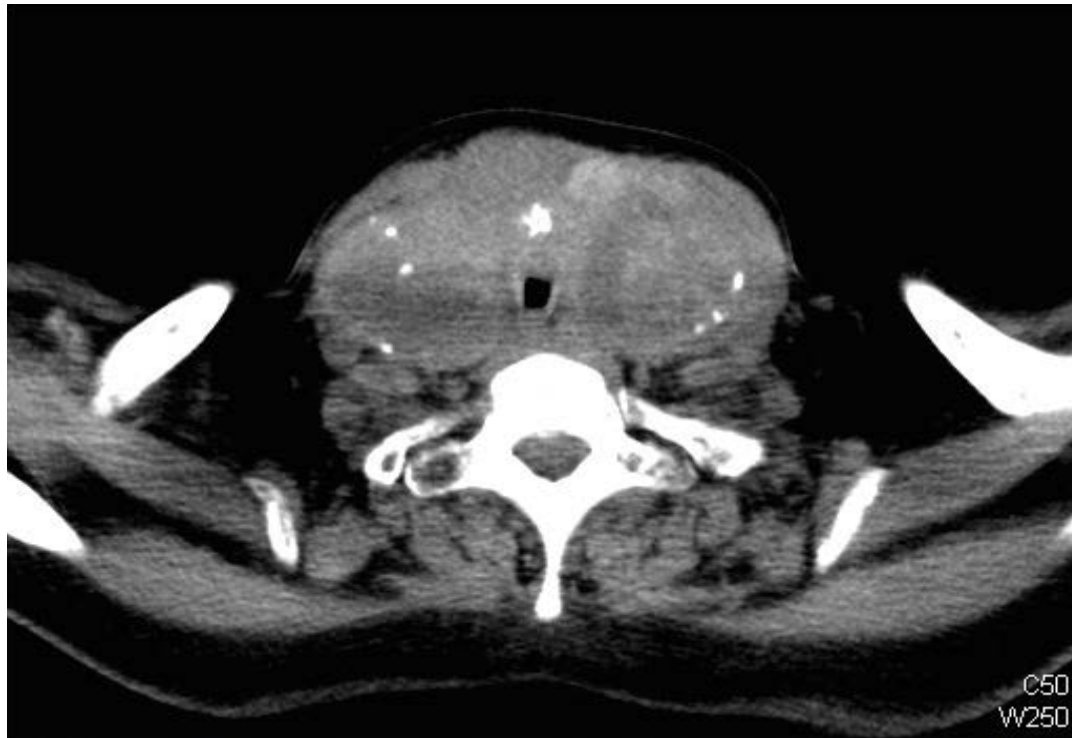
Figure 1: Axial cross section of CT Neck image showing maximal point of trachea compression and invasion caused by diffuse goitre.