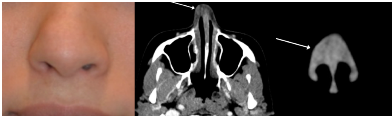
Figure 1: Preoperative photo showing a non-tender, subcutaneous, soft, smooth, raised, round mass in the right supratip region, measuring 8 mm in diameter (Left).

CT with IV contrast showing axial (middle) and coronal (right) images of the enhancing nodular nasal mass measuring 8 mm × 9 mm × 4 mm (CC × AP × TR). The mass was situated over the right nasal cartilage without involvement of the nasal bones or sinuses.