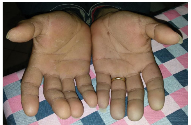
Figure 1: Raynaud phenomenon.

In January 2015 a 52-year-old male was admitted to hospital with dyspnoea and arterial hypertension. Clinical examination highlighted: diffuse cutaneous sclerosis, Raynaud phenomenon (Figure 1) and esophageal dysmotility. Laboratory investigations showed: Creatinine 3.5 mg/dl, Urea 110 mg/dl, Hb: 10.5 gr/dl. A renal biopsy was performed. At light microscopy, among 18 glomeruli, ten showed ischemic collapse with mesangiolytic, glomerular basement membrane reduplication, thickening of interlobular arteries and luminal narrowing due to thrombotic material; slight tubular atrophy and interstitial fibrosis. At immunofluorescence microscopy, focal staining for fibrinogen was seen in arteriolar walls. These findings were attractive for thrombotic microangiopathy. The patient started therapy with hypotensive and steroid drugs. In February 2016 the patient was admitted to hospital with pulmonary oedema and severe arterial hypertension (240/120 mmHg). Due to reduced renal function, the therapy with ACE-Inhibitors was interrupted. At the admission, laboratory investigations demonstrated severe renal failure (Creatinine 8.9 mg/dl) and schistocytes in the peripheral