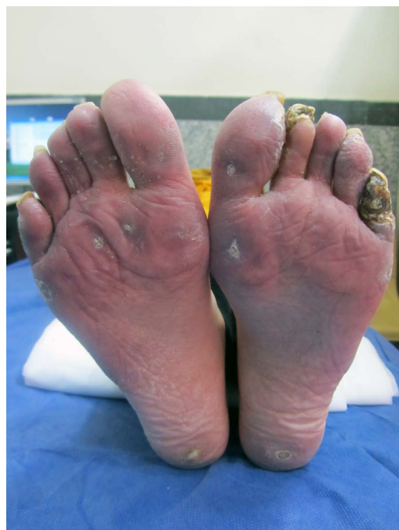
Figure 1: Figure shows foot lesions vascular and non-vascular. Gangrene on 5 th toe of left foot, hyperkeratotic lesion (corn, callous) on metatarsal area and heels.

We classified foot lesions into two vascular and non-vascular (mechanical) lesions. Non-vascular lesions included hyperkeratotic lesions (corn, callous) that arises from mechanical pressure or friction on the skin [12,13]. A corn is a well-defined hyperkeratotic lesion with a central conical core of keratin that causes pain and inflammation. A callus is a diffuse hyperkeratotic area, with relatively even thickness and ill-defined margin. It is usually found under the metatarsal heads, at a site of friction, irritation, and pressure. Like hands, foot vascular lesions include toe tip pitting scar, telangiectasia, ulcer and gangrene or amputation and calcinosis. Mechanical foot lesions are hyperkeratotic lesions, callouses and corn formation in metatarsal, mid foot and