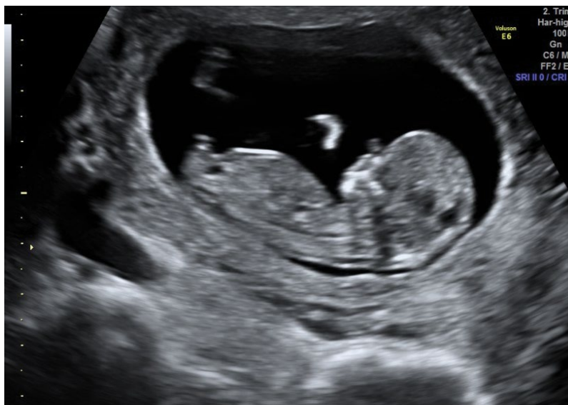
Figure 2: Sagittal echography image corresponding to a normo-evolutive foetus at week 12. Images shows no alteration and normal amniotic liquid proportion.

supplement with a specific inositol ratio (3.6:1 MYO/DCI), antioxidants, vitamins, and minerals. Two months after the start of supplementation, the patient came in with amenorrhea and a positive pregnancy test. An echography was performed finding a 3-week gestational sac. The echography was repeated 3 weeks later, confirming a viable 5-week embryo with normal cardiac activity. The supplementation was maintained until week 12 of pregnancy. The patient gave birth to a healthy baby after a pregnancy of normal length and without any relevant obstetric-gynecological complications.