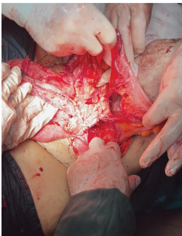
Figure 4: Started devascularization of colonic segment after inferior mesenteric artery ligation and excision of part of mesentery during placental removal.

After extraction of the fetus, placenta was found to be invading sigmoid colon mesentery and the left infundibulopelvic ligament. Removal of the placenta was done but resulted in injury to inferior mesenteric artery and left infundibulopelvic ligament.