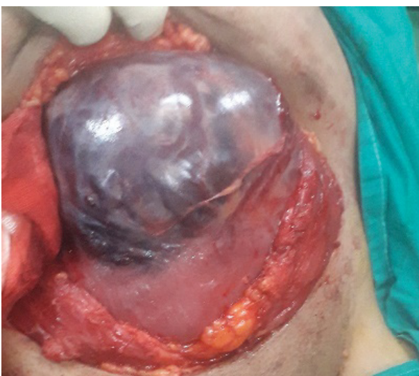
Figure 2: Empty uterus with extensive vascularity at left cornual end extending to left infundibulopelvic ligament.

stable with pulse of 80 beats/min and blood pressure of 120/80. Abdominopelvic examination showed fundal level of 38 weeks with no detected uterine contractions and closed cervical canal. Ultrasound was done which showed a 37 weeks of gestation viable fetus with normal heart rate at breech presentation with normal amount of amniotic fluid. In the operating room, the incision of the abdomen was done through pfannestial incision, after accessing the peritoneal cavity, the uterus showed abnormal vascularity at left broad ligament and left cornual end extending to left infundibulopelvic ligament (Figure 2).