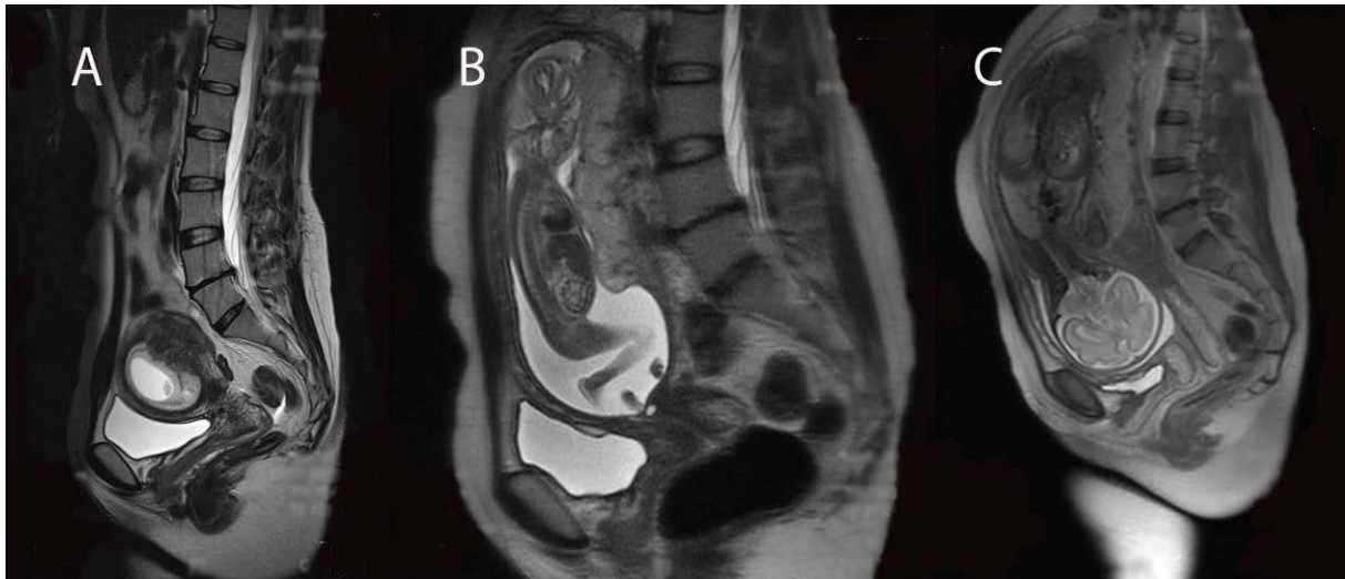
Figure 2: MRI scans during pregnancy week 8 and 15

A selection of MRI's from 8 weeks gestational age (A), 15 weeks (B) and 27 weeks (C) is shown.