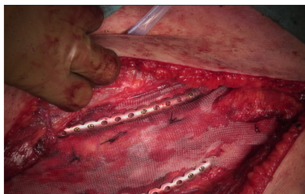
Figure 1d: Intraoperative photograph showing reconstruction of the chest wall using the MatrixRIB™ fixation system in combination with a Marlex polypropylene mesh.

management. He developed mild to moderate dyspnoea due to inadequate respiration, caused by pain for which an epidural catheter was placed. Because of further clinical decline the patient was planned for surgery. During the procedure a significant hernia sac covered by parietal pleura was found (Figure 1c). The rib cage was reconstructed using plates and vicryl sutures. Next, a polypropylene mesh was placed between the ribs for reinforcement (Figure 1d). There were no postoperative complications and in the next few days a full recovery followed. One year after surgery the patient was in good health and reported to have no discomfort during respiration or other physical discomfort.