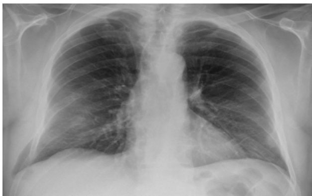
Figure 1a: Plain chest radiograph on admission shows dorsal fractures ribs 7, 8 and 9 on the right side and herniation of lung tissue between ribs 7 and 8.