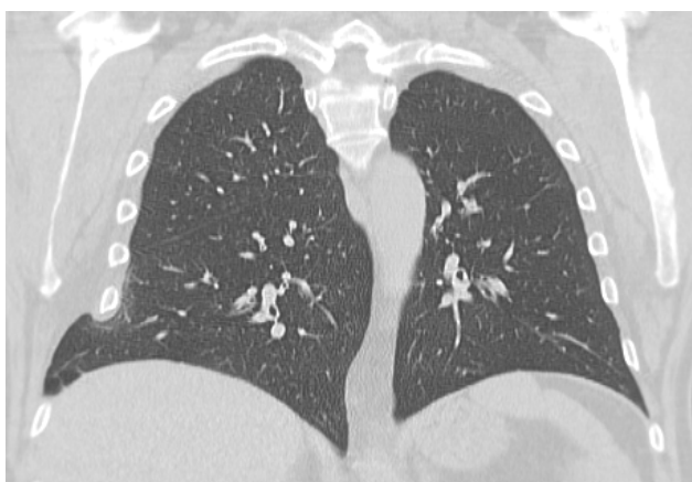
Figure 1b: Computed tomogram frontal plane view shows herniation of lung tissue between ribs 7 and 8 on the right side.

ping was often used in the past, this method has been abandoned because it reduces thoracic wall motion and thereby increases the risk of impaired respiration with subsequent atelectasis and infection [10]. Currently, most patients with symptomatic long hernias undergo early surgical repair with excellent results and low morbidity [4,6].