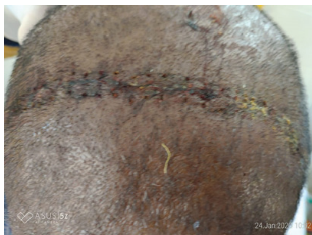
Figure 4: Proper wound healing after suture removal on 7 th post stitch day, electrocautery skin incision of Figure 2 .

through body or human tissue. Standard alternating electric current at 60 cycle per second stimulates nerves and muscles giving rise to electric shock like effect. Nerve and muscle stimulation ceases at 100,000 cycles per second (100 kilohertz) and there is no electrocution. For electrocautery, standard alternating electric current is converted into high frequency (radio frequency) by electrocautery generator also called electrocautery unit (ESU). Hand piece connected to the ESU, is applied to the tissue for desired effect. Hand piece is either monopolar or bipolar, difference between two is that in monopolar hand piece has one electrode while in bipolar both electrodes are in hand piece. Constant waveform of low voltage generated from ESU gives cutting effect to the tissue, while intermittent waveform of high voltage helps in coagulation.