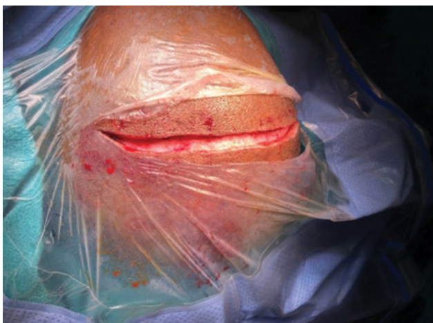
Figure 2: Skin incision with electrocautery, cutting monopolar needle electrode.