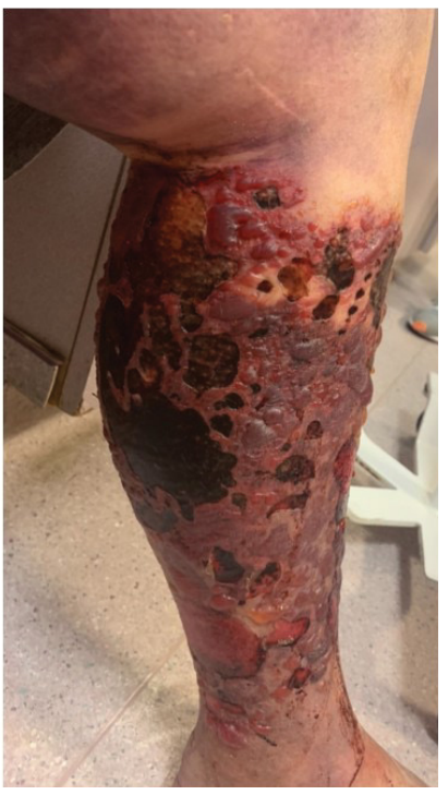
Figure 1: (A) CT of the lower extremity demonstrated edema of the subcutaneous compartments initially suggestive of cellulitis; (B) The anterior lower leg distal to knee was extremely tender to light palpation with extensive bruising with in duration extending from point of impact proximally to the left thigh.

organism growth. During fasciotomy, a large posterior hematoma was found to dissect soft tissues across fascial planes resulting in compression syndrome of the posterior muscular compartments. Pale ischemic changes of the gastrocnemius and soleus musculature were visualized. Given that patient had atrial fibrillation CHA2DS2-VASc score of 6 and heart rate of 120 preoperatively, debridement interventions placed patient at low risk for significant bleeding. Patient was treated with Metoprolol Succinate to maintain heart rate below 110 beats per minute. Apixaban was restarted on postoperative day one. Multiple debridement operations were performed and split-thickness skin graft was applied. Patient's wound healed well at one month reevaluation.